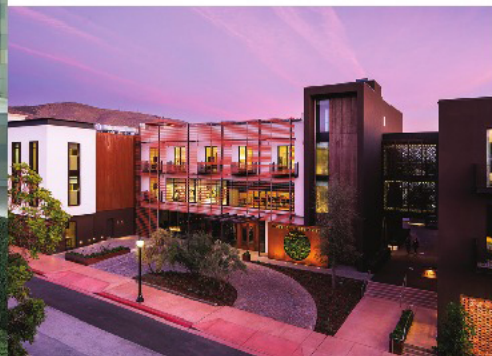
At Hotel San Luis Obispo (above) bright, modern guest rooms (left) are accented with warm touches like natural wood and hand-woven rugs.

perspectives of the treasured greenbelt, which is roughly comprised of the Morros volcanic peaks, Cuesta Ridge, Irish Hills, and High School Hill, can be seen from the rooftop bar at the new Hotel San Luis Obispo (hotel-slo.com; from $395). Developed by the group that started Hotel Healdsburg, the modern, 78-room Hotel San Luis Obispo introduces an elevated level of luxury to the city, which is anchored by Mission San Luis Obispo de Tolosa and Edna Valley wine country to the south. "This type of property will attract a new